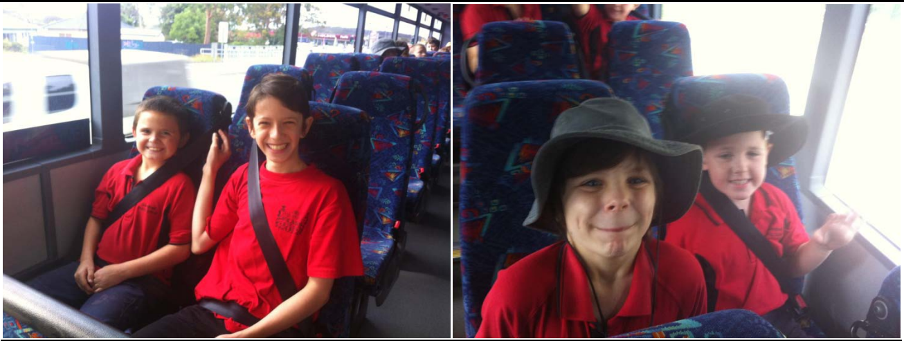
Ready to go to Oakdale!