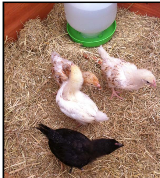
Our baby chickens are growing up and are slowly starting to move into their new chicken coup...bawk, bawk.....)