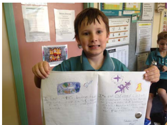
Banjo is writing lots of sentences every day!