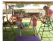
A large and engaging outdoor play area