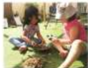
An educational, play-based curriculum

KU Windale offers high quality, not for profit early education for children aged 3 to 5 years, including: