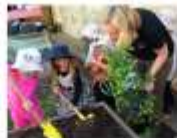
Qualified, caring and experienced educators