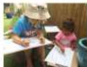
A full transition to school program