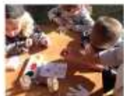
An inclusive environment with Aboriginal perspectives